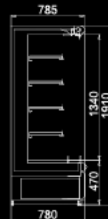
LD open type, remote