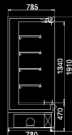
LD open type, plug-in