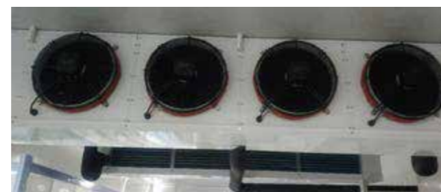
Coolasure Series air cooler