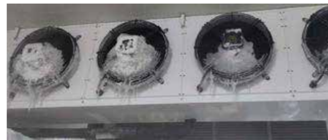
General air cooler